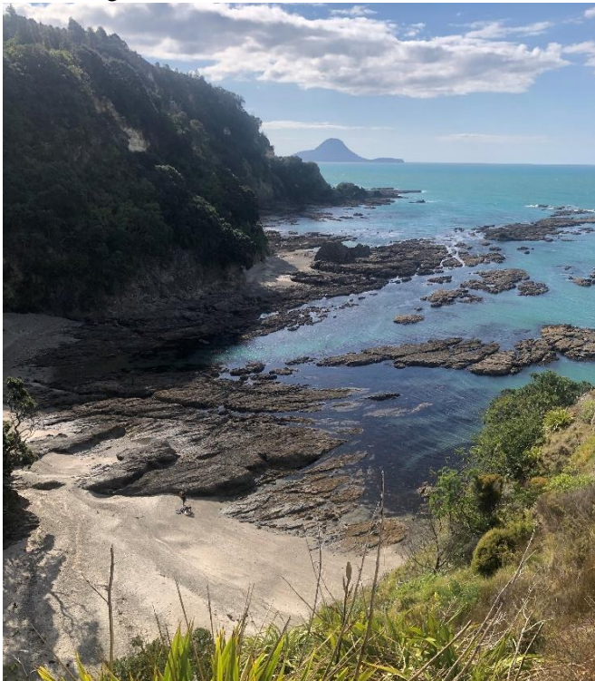
The Coast