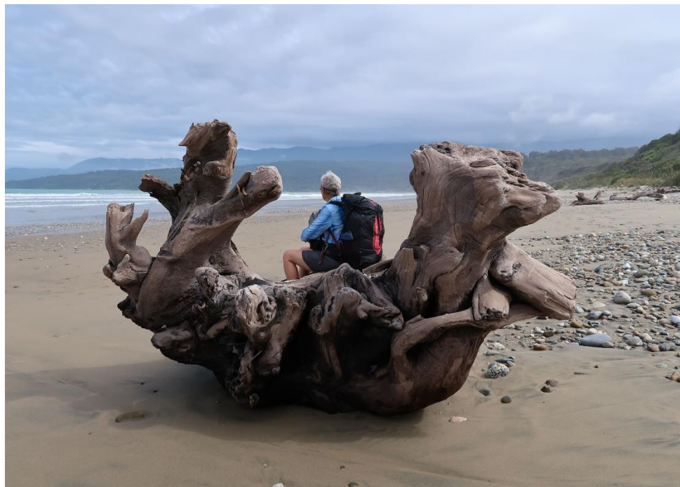
Te Waewae Bay