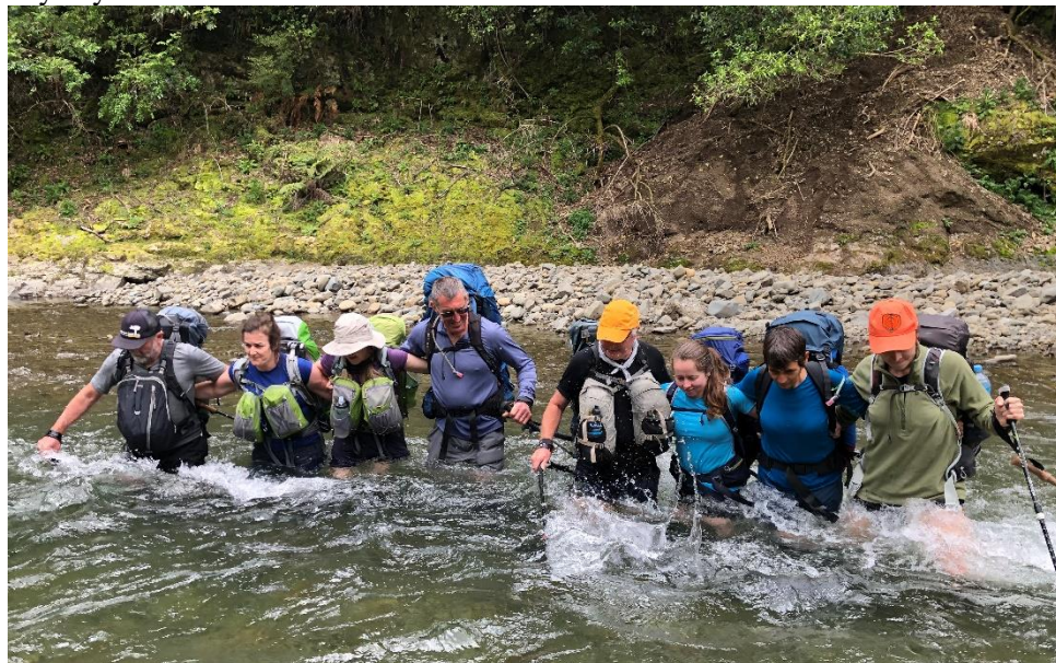
River Crossing practice

Saturday: After varying reports of good sleep/bad sleep we set off in the van descending into farmland and bush, metal road, many turns and then stumbled on a ute perched precariously at the edge of a cliff with a significant drop down below into the gorge. The underneath of the ute well and truly stuck. No driver, and two farm dogs in the dog boxes at the back. What happened? Driving on, we came upon a sheepish man on a quad bike, who was the owner of the ute. A tractor was on its way to get the ute moved. We continued to drive... carefully. Needless to say, the ute was gone on our way back. So all was well, we think. We donned our packs at the very full Moanui Rd carpark and set off to the aptly named, 'the burn', and things did start burning for some of us. Up we went, cows and cow poo. A break for lunch, and over the top. I was last but that's ok. Into the beautiful bush we went, eventually arriving at Tawa Hut to set up our tents. Tawa Hut only has 6 bunks, not enough for the 13 of us. But camping is much more fun anyway.