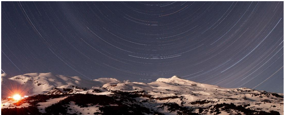
Around the mountain