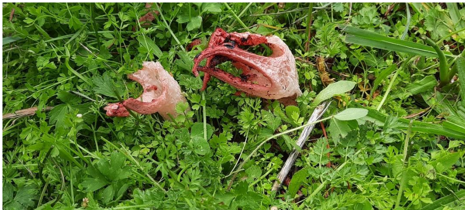
Asorea rubra - a chance find on farmland