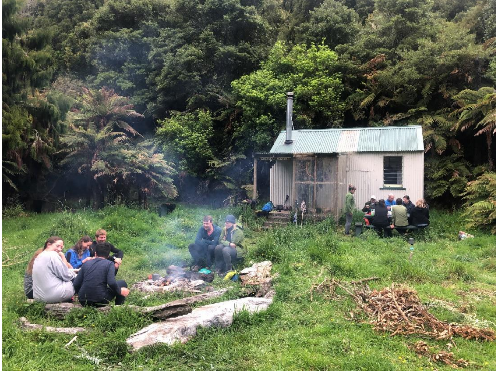
Koranga Forks Hut

The weather was good, no rain forecast, and the Kahanui river was flowing but not too high. We spent the day in and out of the river, reading the watercourse, the best place to cross, linking together to support each other through the more forceful parts. We took turns later in the day to lead and discuss with Allen the best possible place to cross. Some areas were trickier to negotiate, requiring us hold on to, or clamber over large fallen trees in the river. On the banks of the river, taking time to look up at the pristine bush were kowhai trees in bloom. Tuks could be heard. It felt fair away from Hamilton. After a shorter time than predicted we arrived at Koranga Forks hut. One campsite already taken so we set up our tents under the punga and trees. Pack float training to follow, and those that did it, floated very well, caught by Flo and Allen to avoid disappearing downstream. Sleeping in our tents at night the rurus were calling. I thought I heard a kiwi, but after some investigation on NZ bird online I realised I'd heard a long tail cuckoo! Never mind. The Koranga Forks long drop was interesting. You required limited movement once inside as it had a tendency to feel like you were experiencing a small earthquake! One campsite already taken so we set up our tents under the punga and trees.