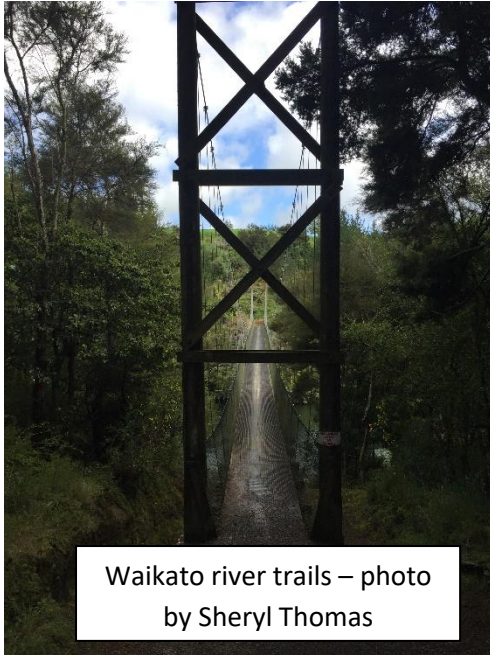
Waikato river trails