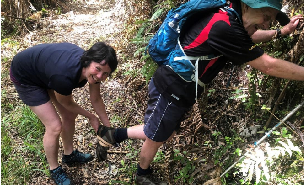
The patch-up job