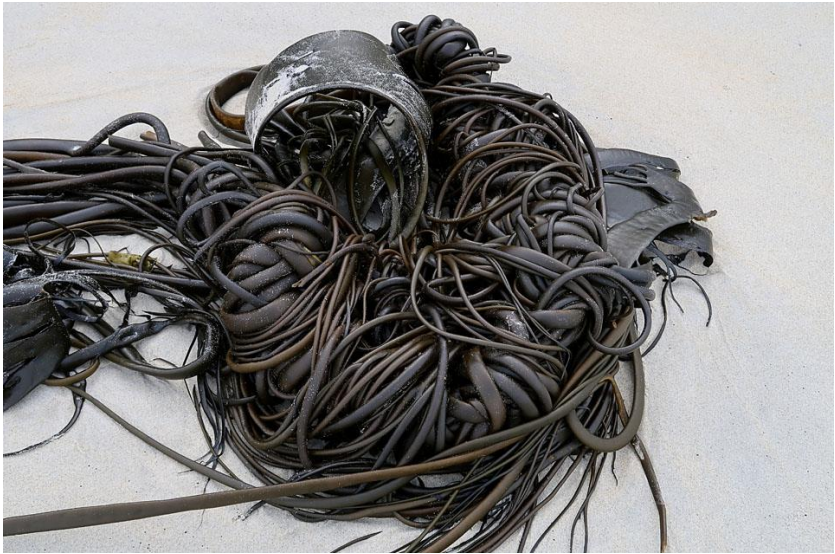
Beached Kelp

~~~~~ Here are some of the fabulous entries to our 2020 photo competition.