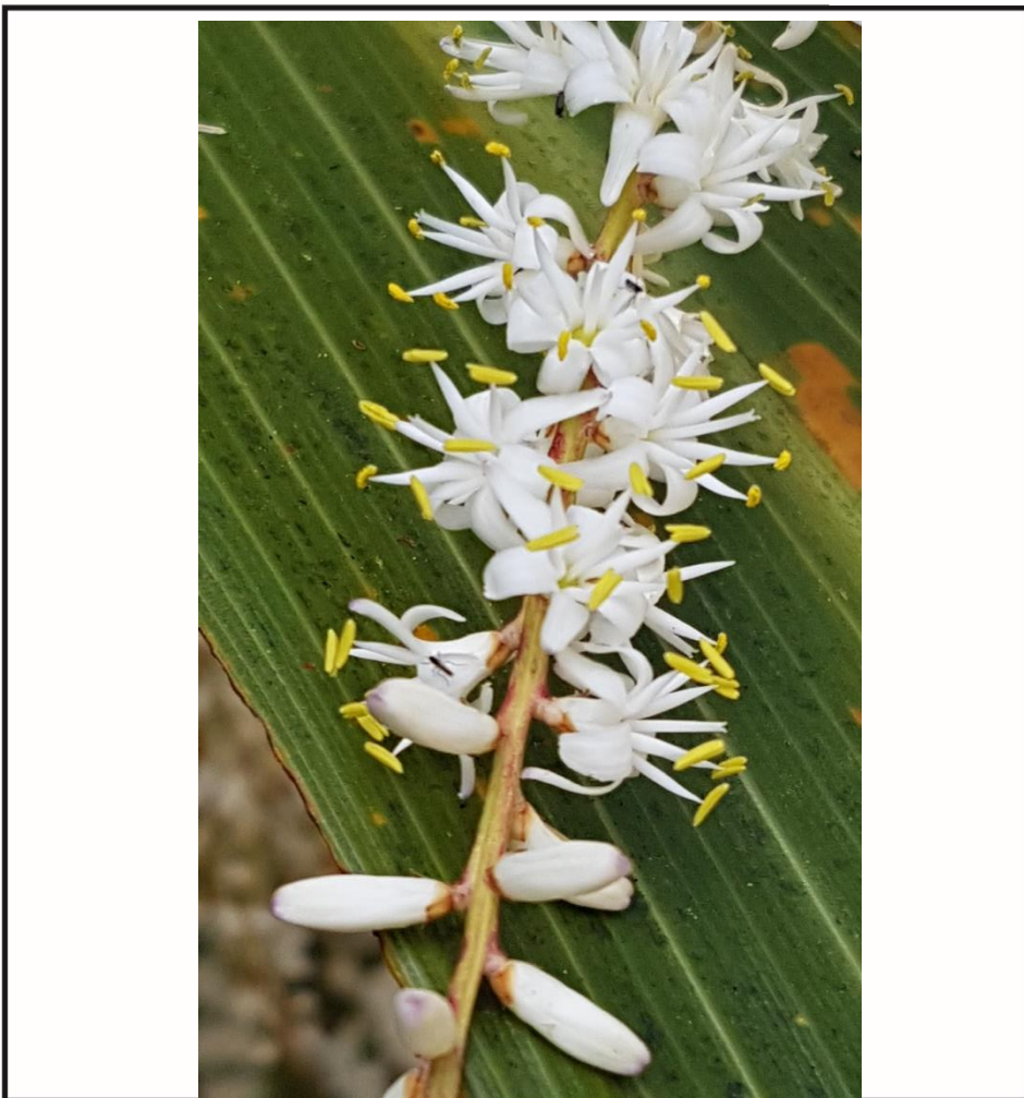
Cabbage tree flowers

Member of: Federated Mountain Clubs of New Zealand Inc Ruapehu Mountain Clubs Association