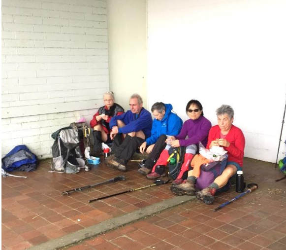
The bunker stop

After all the doom with regards to the predicted weather on the trip over we arrived to a dry Te Aroha and a visible peak. Slowly but surely we headed off up the track with some lovely views out over the plains to the foothills on the other side, the weather to the south was not conducive to seeing any mountains this time. We arrived at the top to a fast-changing view, no view, view, no view