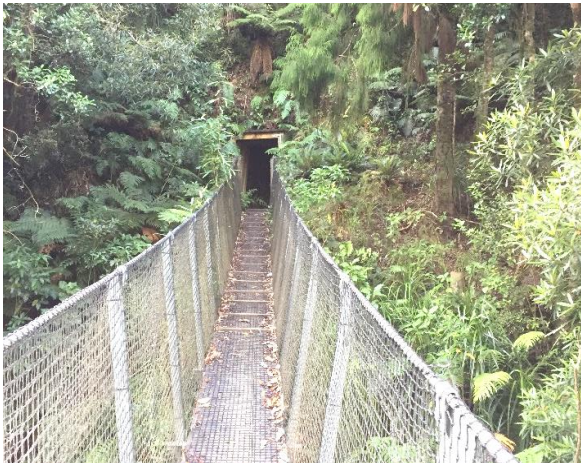
The swingbridge and tunnel