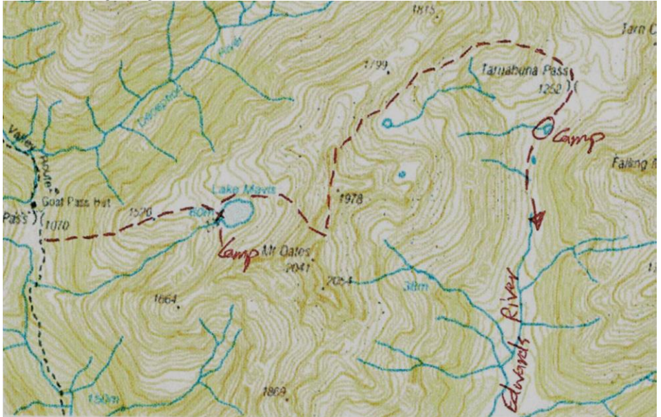
Map showing rough route between Goats Pass and Taruahuna Pass

Thursday 16 th – Awoke to a lovely morning and our destination to Taruahuna Pass. It was to be a short walking day! This part of the trip, there were no tracks or poled routes to follow. However, on part of the descent section there were cairns to follow.