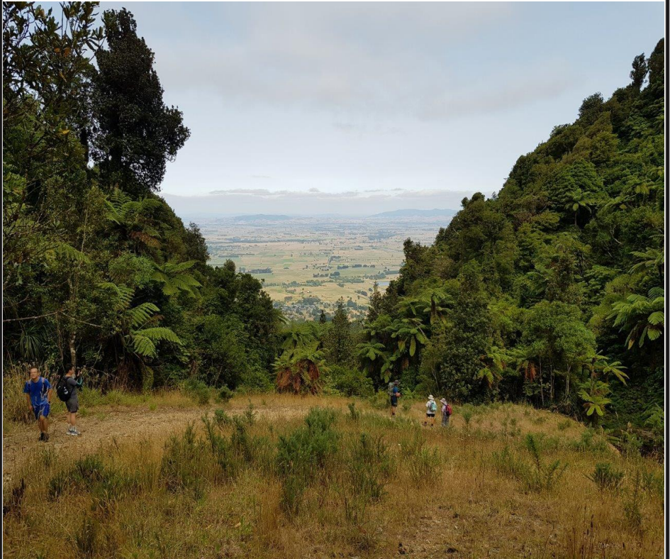
Tui mine track to Mt. Te Aroha