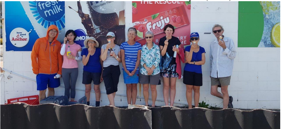
For all the 'hard' work done on the day..... a reward