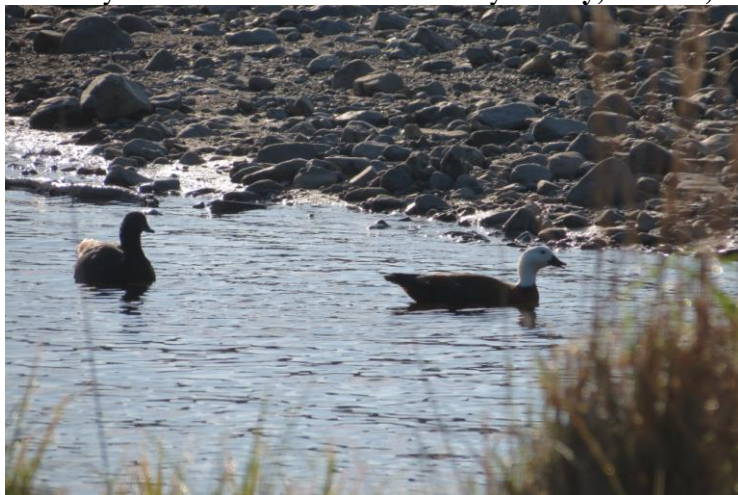
Paradise ducks at Oamaru Lodge

~~~~~ Next Month: Email your contributions to the editor by Friday, 8 th Feb., 2019