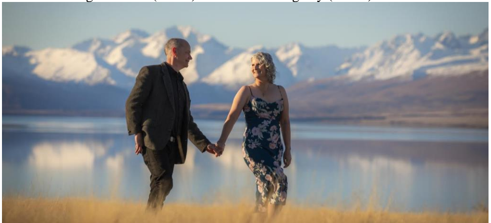
Cutting the cake (above) and the wedding day (below)