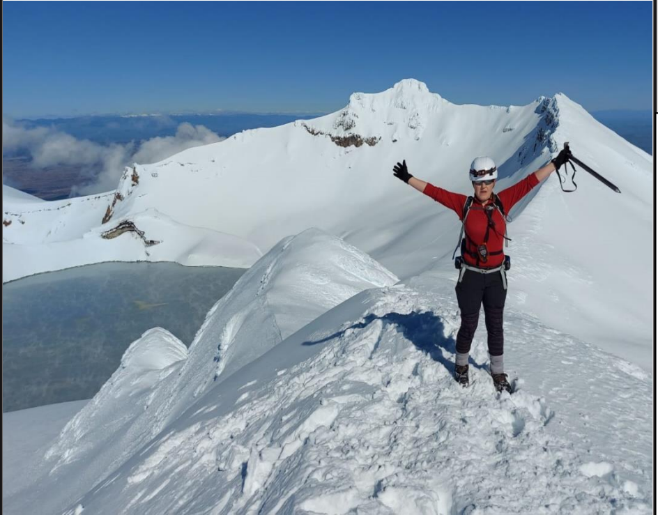
Success on Paretaitonga