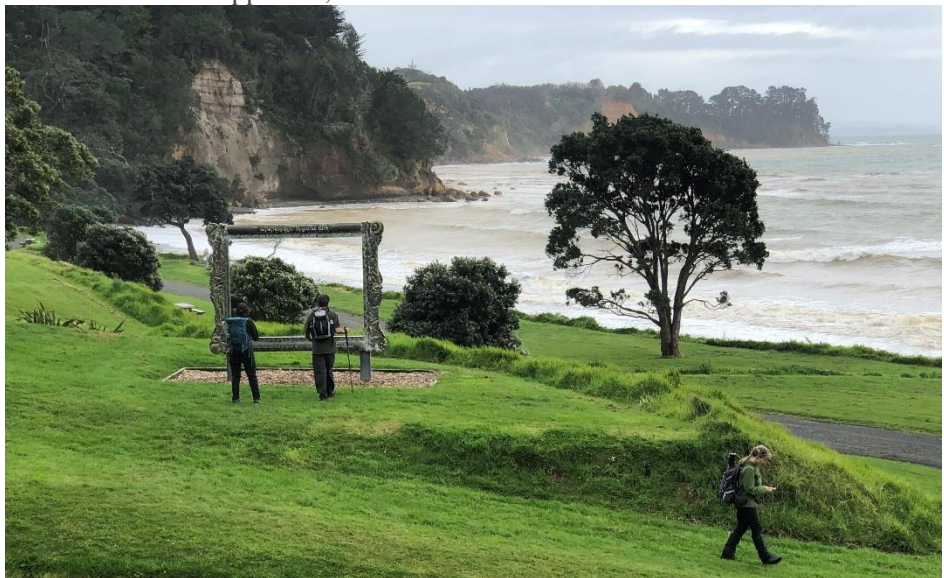
A beautiful beach

Regional Park, which is a farm-park with short coastal walks. We visited the Ashby Homestead – a family lived here with 13 kids! So Isolated – you won't be able to 'pop down to the shop for minor groceries'! We walked on the beach over streams along the coastal side – magnificent views! Back to the van and off to Orere Top 10 Holiday Park at Orere point where we were appointed our cabins. Before the sun disappeared, we went for a walk on the beach. Wow!