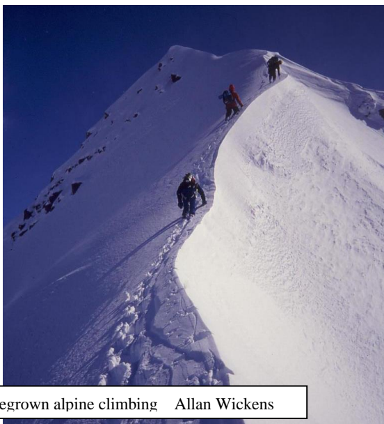
Homegrown alpine climbing Allan Wickens

Sunday 19 November. This day will be used for walking/climbing if Saturday’s planned events are postponed due to bad weather. The weekend’s event will wrap up late in the afternoon. Otherwise, feel free to relax and take in the ambience of our Hut and surroundings.