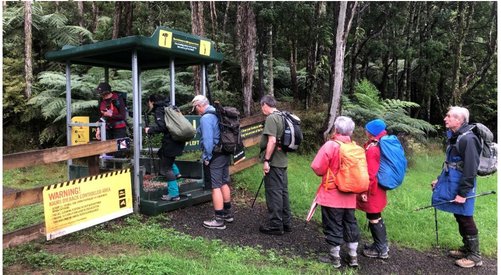
Kauri dieback prevention measures

not a drop of rain! After spending a few hours there, we travelled north to Tapapakanga