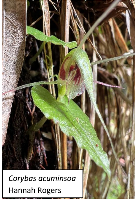
Corybas acuminosa