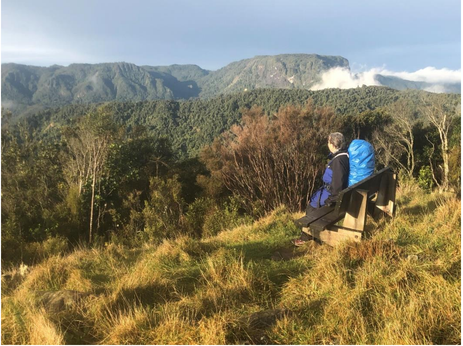
Table Mountain from Crosbies Clearing