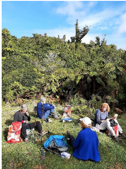
Lindemann's Loop Track – Wairoa Shelter