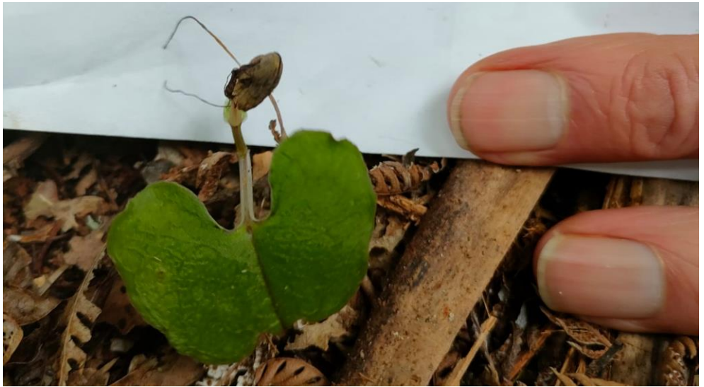
Spider orchid almost ready to open its' flower