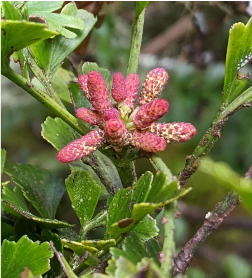
Tanekaha cones at Te Kauri Park