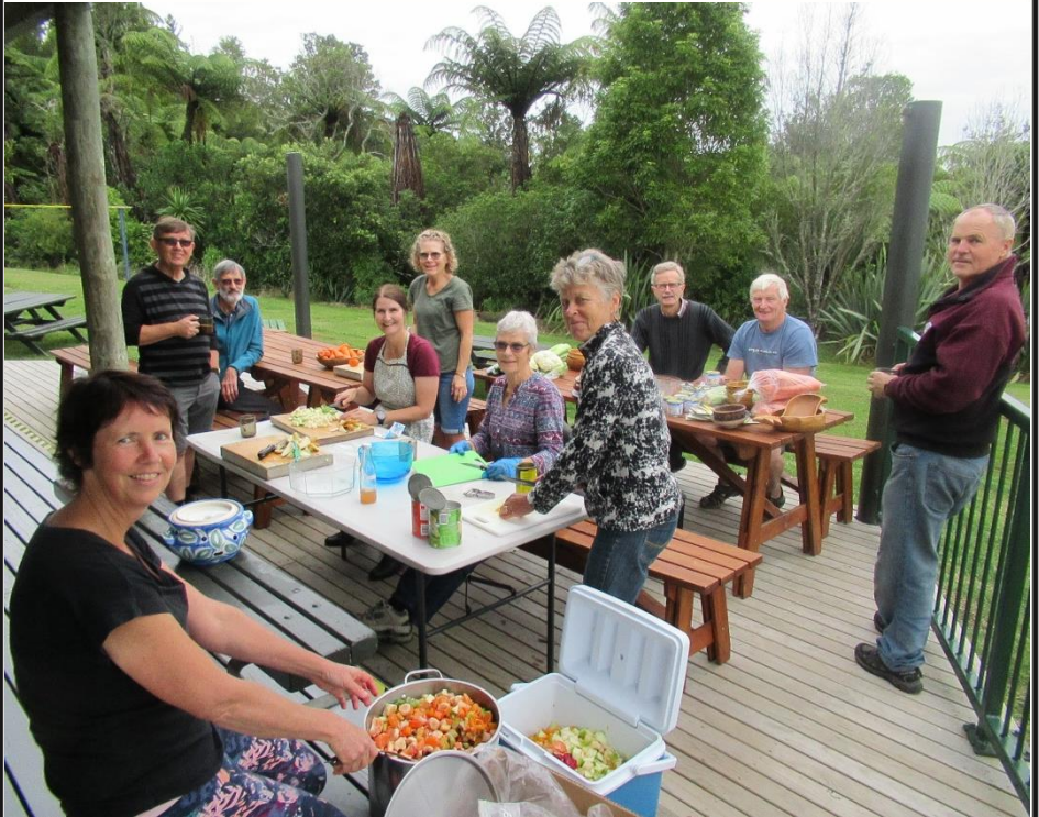
The reunion working crew