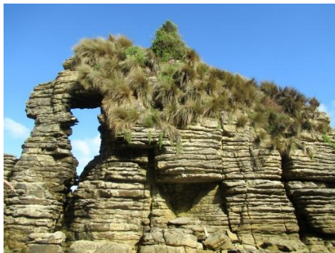
Pancake rocks at Carters Beach

If it's a clear day we should be able to admire Mt Taranaki from a distance. Heading north, we explore along Carters Beach where there are unusual erosion shapes. We then return back over the farm. An easy walk that would suit young and old.