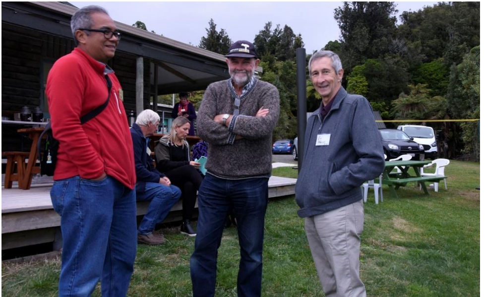
Relatively newer members of the club i.e. not quite 50 years