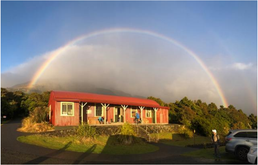
A bubble over The Camphouse and cloud over Mt Taranaki