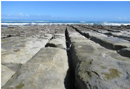
Carters beach rocks